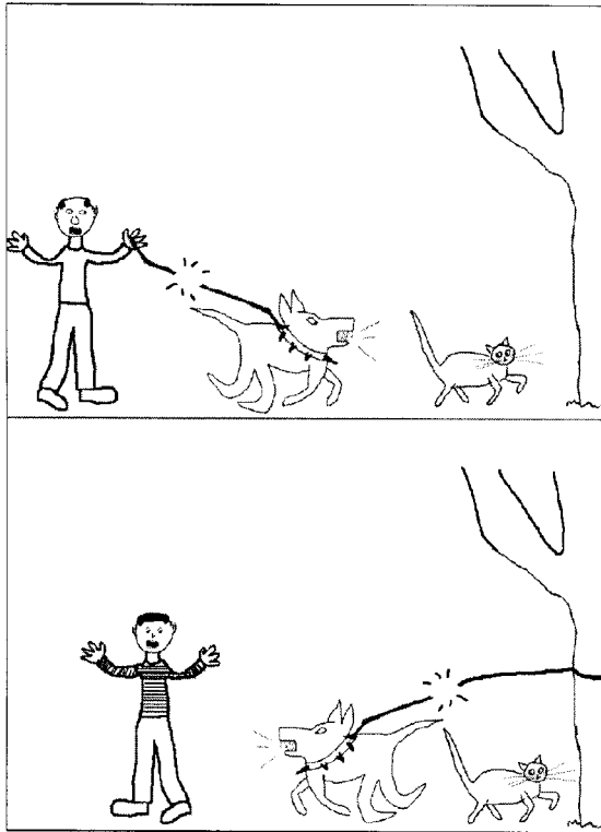
Figure 1. Analogical picture-pair with cross-mapping: man in top picture may be mapped to bottom picture as the man (attribute mapping) or the tree (relational mapping).

Materials. The stimuli were ten pairs of analogical pictures, eight pairs of which were used in experiments by Markman and Gentner (1993). The other two pairs (one of which is the example shown in Figure 1) were created by the first author using a computer graphics program. All of the pictures were black and white line drawings. The stimuli were presented using SuperLab computer software running on a Macintosh PowerPC computer with a 15-inch Apple monitor. These analogical pictures are such that for a key object (e.g., the man in the top picture of Figure 1), attribute mapping based on physical characteristics of individual objects would yield one response (the man in the bottom picture), whereas relational mapping based on roles linking multiple objects would yield